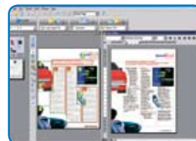
Capture text from PDF files and automatically save it as a fully editable, fully formatted Word document.