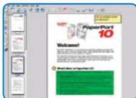
Add annotations to scanned images: notes, basic text, highlights, lines and arrows, stamps.